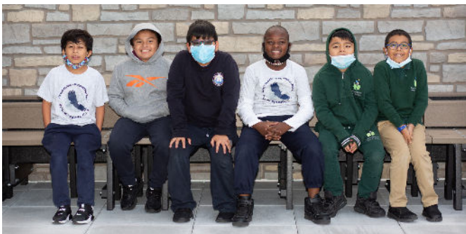
Fourth-graders in the After-School Academy take a break after playing in the rooftop garden.