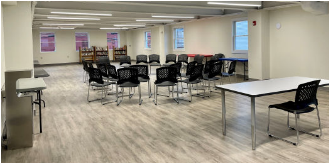
Before the building expansion, there was no space large enough to accommodate large group activities.

The Oasis Building Expansion project, begun in November 2020, is now complete! In addition to a retail store, an expanded childcare room, and multiple new classrooms, the expansion provides: