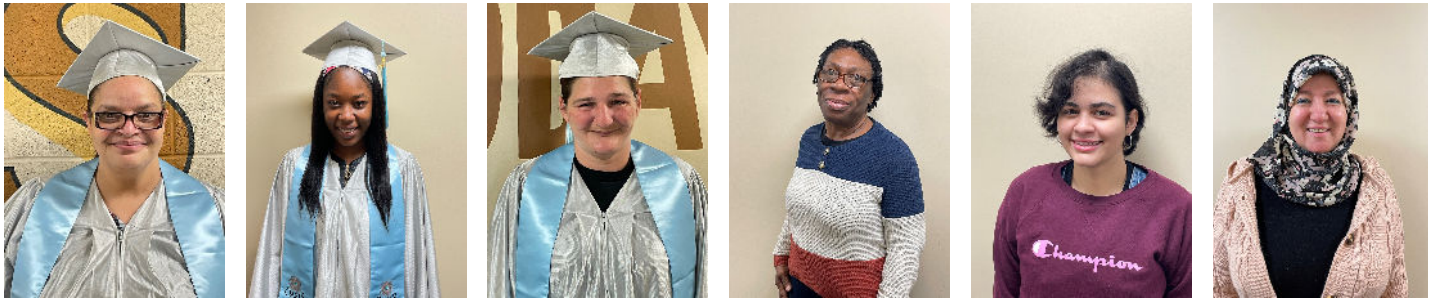
Some recent Oasis GED graduates and some current students.